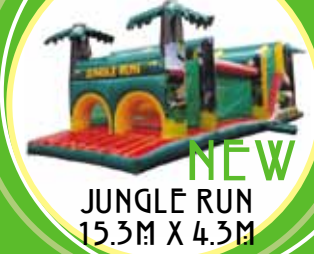
NEW JUNGLE RUN 15.5M X 4.5M