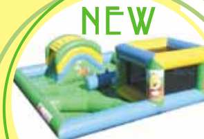
NEW FARM PLAYZONE 5M X 4M

Age: 2-7 years & 8-12 years Dates: 1, 3, 6 & 8 April Times: 4pm – 5pm (2-7 years) & 5pm – 6pm (8-12 years) Cost: £3 per child, per session