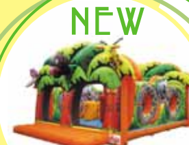
NEW JUNGLE KINGDOM 8.5M X 6.1M